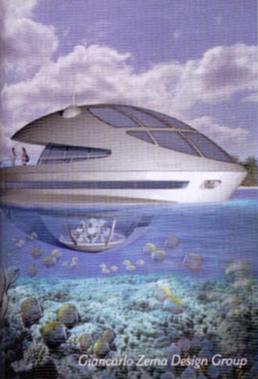
Giancarlo Zema Design Group

assistance and more. The town centre is a short walk and an 18-hole golf course is nearby. New berths and dredging facilities are planned.